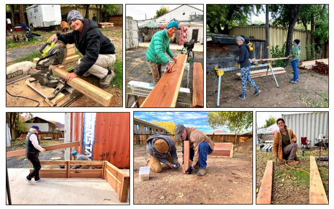
Finishing touches and irrigation assembly, March 17, 2023

Build days November 6 & November 12, 2022